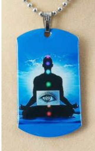
Chakra Aura Third Eye Activation Mec Tech Cell

All you do is place your favorite Mec Tech Power Cell on your left wrist pulse with the Sacred geometry Sigil touching your pulse point. Then you just place your watch over the sigil and strap it to your wrist to secure it there and hit the power button. You're now sending Mec Tech Power coursing through your very veins!!